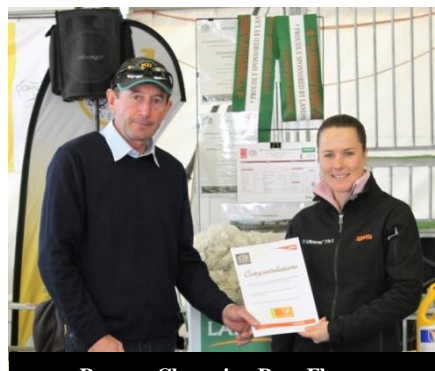
Reserve Champion Ram Fleece 2016 Australian Sheep and Wool Show